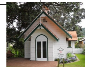
Christ Church 56 Waiwera Rd Waiwera