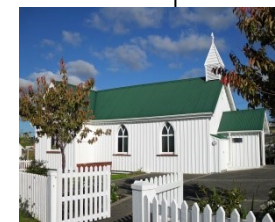
Holy Trinity 24 Wainui Rd Silverdale