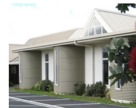
St Chad's 117 Centreway Rd Orewa